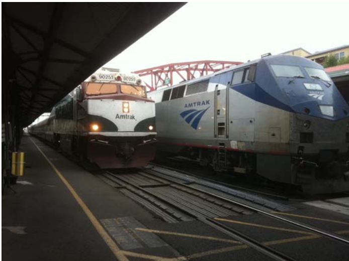
Above: Empire Builder #27 west bound and Amtrak Cascades #501 from Vancouver, BC arrive at Portland, OR on August 9, 2011. Photos by Bill Corum who was traveling on the Empire Builder.