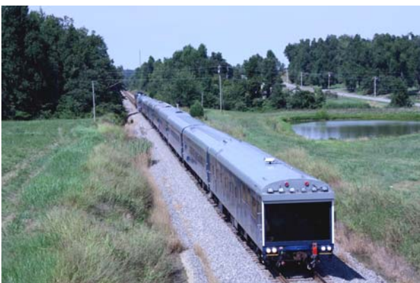
Left: Tail shot of the CSX business train from Brown Badgett Loop wooden bridge, Madisonville, KY.